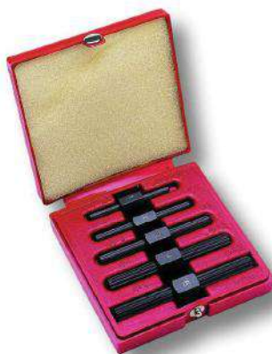
Stud extractor set 5010