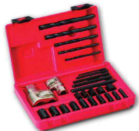
9001 Series Set