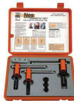
Model : NES1007