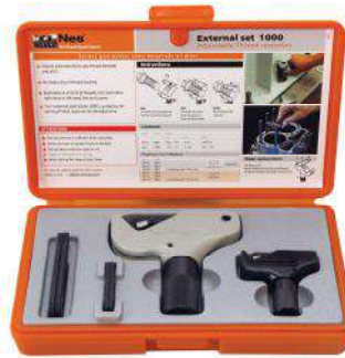
Model : NES12