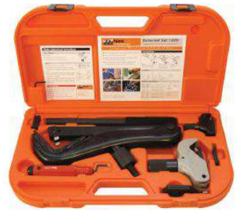
Model : NES123