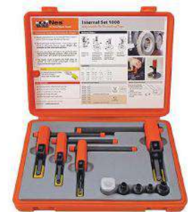
Model : NES1008