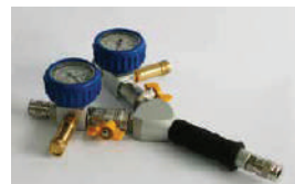
Simplified Valve Controller

1 outlets 1/4" CPF: ref.67761 - 10 bar CLT: ref.67192 - 8 bar CLC: ref.67762 - 1 bar