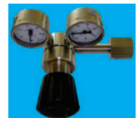
Pressure Relief Valve