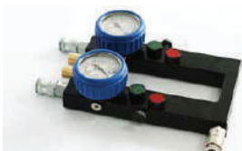
Push Button Controller

1 outlets 1/4" CPF: ref.67759 - 10 bar CLT: ref.66907 - 8 bar CLC: ref.67760 - 1 bar