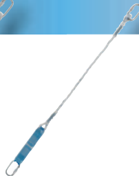
FALL ARREST LANYARD